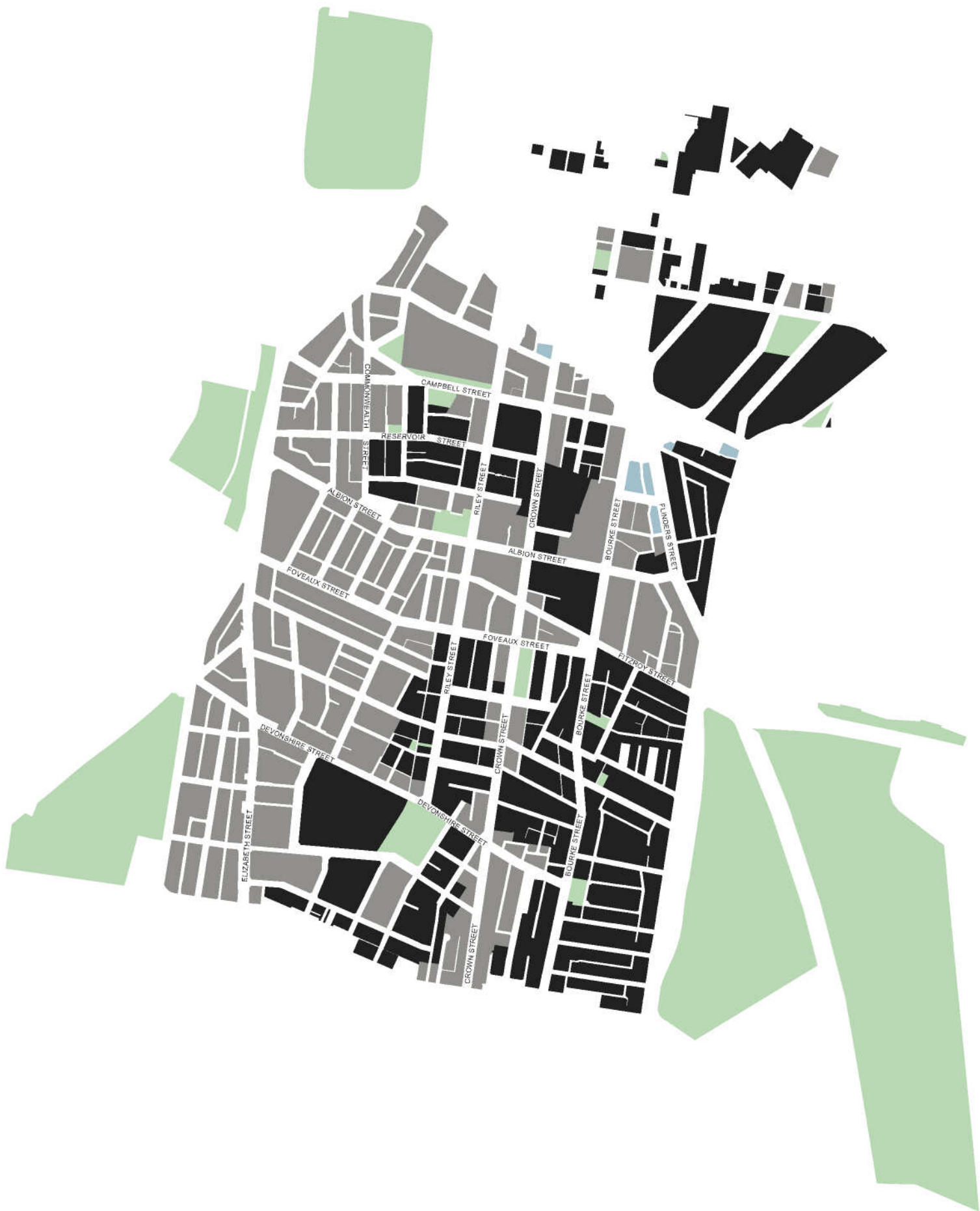
recent median sale prices